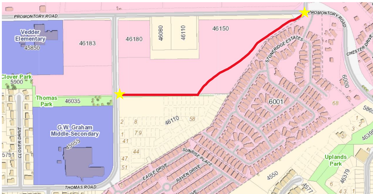
* red mark-up shows path from the bottom of Promontory to the crosswalk across from GWG

Secondary students who reside outside of walk limits for GW Graham Secondary will still be considered Regular Riders. (See attached for Promontory area that falls within secondary student walk limits)