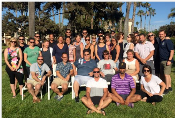
Figure 1: The San Diego AMLE Team